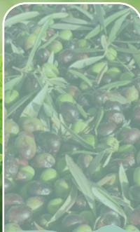
Olive oil waste